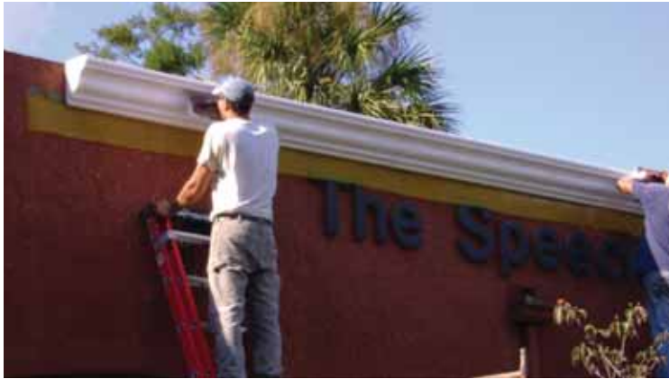
Workers adding and painting crown molding to roof of JSHC.