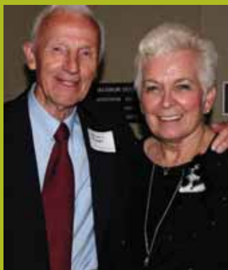
Our Gold Star 4 Board Member is...