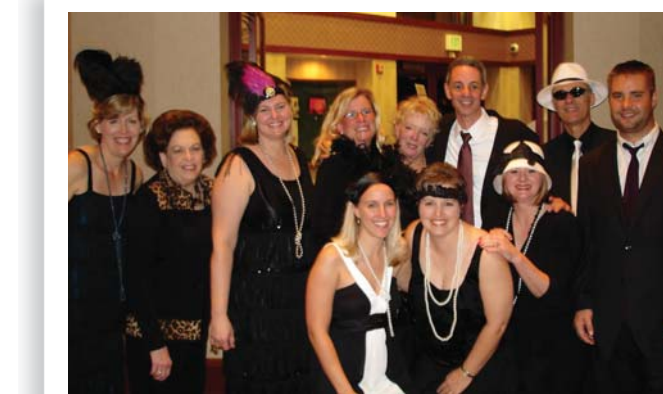
JSHC Staff on the evening of the event.

hors d'ouvres from Biscotti's, a complementary wine and martini bar, continuous music provided by the Stevens Quartet, and several video screens provided by Sights and Sounds, Inc., with continuously playing silent movies. Many of the JSHC staff were in attire of the silent movie era to add to the festivities. The silent auction was a huge hit and our drawing, a weeklong stay at a beach front cottage in